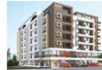
MATHA Jyothi Residency NH66, Near NITK Engineering College & Srinivas Institute of Technology Mukka, Surathkal