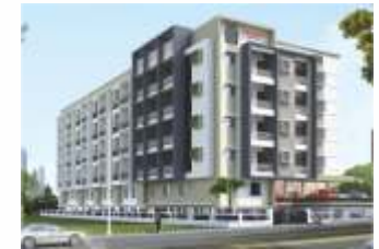
MATHA Residency Mulky NH66, Mulky