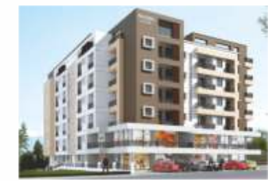
MATHA Jyothi Residency NH66, Near NITK Engineering College & Srinivas Institute of Technology Mukka, Surathkal