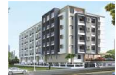
MATHA Residency Mulky NH66, Mulky