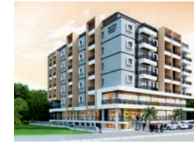
MATHA Residency NH-66, Padubidri