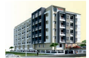
MATHA Residency Mulky NH-66, Mulky